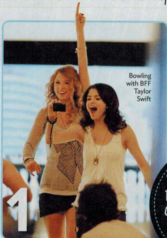
Bowling with BFF Taylor Swift

As one of the world's biggest superstars, Selena Gomez likes to keep some things private, but we're revealing five Sel secrets that she doesn't want to hold onto any longer!